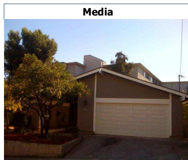
View All 8 Pictures