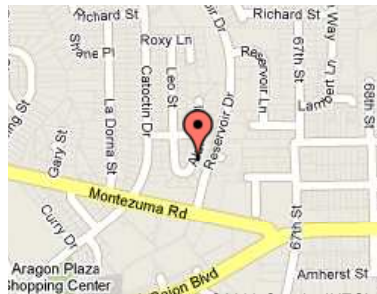
View Full Size Map